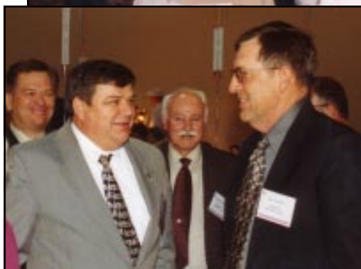
The KEC 61st Annual Meeting was held Jan. 27-29, 2003, at the Capitol Plaza in Topeka, KS.