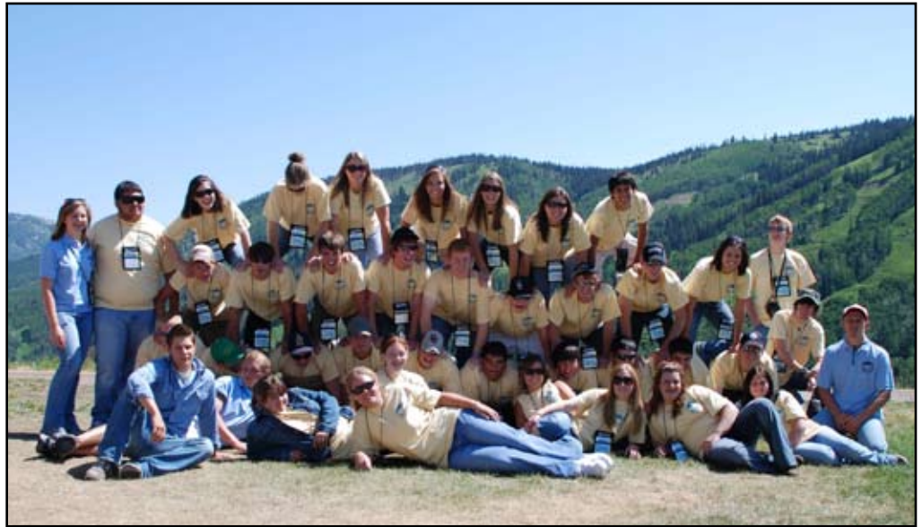
The Kansas and Oklahoma youth pose on top of Mt. Werner near Steamboat Springs during the Cooperative Youth Leadership Camp.