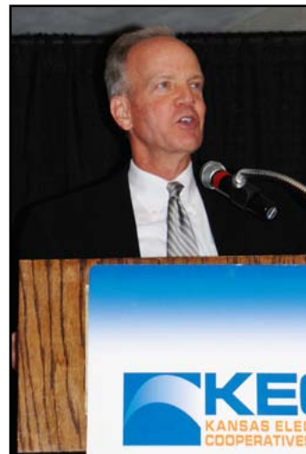
Senator Jerry Moran

meeting included Senator Jerry Moran who talked about the nation's economy, policies to create job, the health care reform bill, and EPA's efforts to regulate greenhouse gasses.