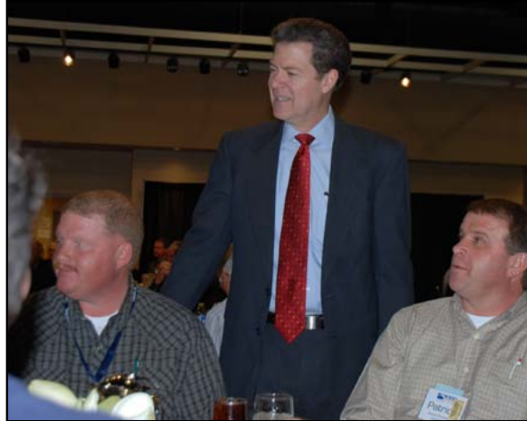
Governor Sam Brownback visits with the managers and trustees at the KEC Annual Meeting luncheon on Jan. 24.