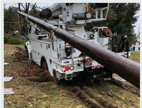
FreeState crews struggle with muddy conditions as they restore service at Carroll Electric Cooperative in Arkansas.

Q During a Kansas RESAP Observation, the observation team viewed an underground installation with a pad-mounted transformer in close proximity to an LP-Gas container. What is the industry standard that specifically addresses this type of installation?