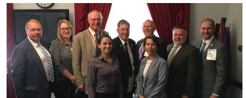
Clockwise: KEC and member cooperative representatives met with Sen. Jerry Moran, Representative Sharice Davids, Sen. Pat Roberts, and Congressman Steve Watkins during their visit to Washington, D.C. (Not pictured are the visits with Congressmen Roger Marshall and Ron Estes.)