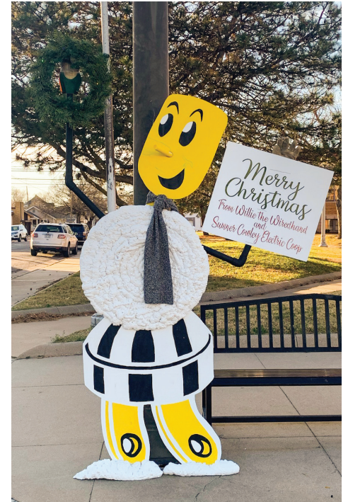
Sumner-Cowley wins first place with their Willie Wiredhand snowman decoration in Wellington's light pole decorating contest.

the foster care system. Gifts were pre-wrapped for distribution. In addition, Wheatland also awarded a $1,000 Sharing Success grant for Saint Francis' Angel Tree program.