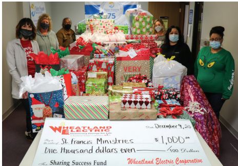
Wheatland employees donate gifts and a Sharing Success grant to the Saint Francis Angel Tree program.

SUMNER-COWLEY won first place in the Wellington Area Chamber of Commerce Snowman Light Pole Decorating Contest. The co-op decorated their pole with Willie Wiredhand dressed as a snowman. The purpose of the contest was to provide an opportunity for people and businesses to get involved and to make the downtown district welcoming and festive. Sumner-Cowley donated the $100 prize to the Wellington Food Bank.