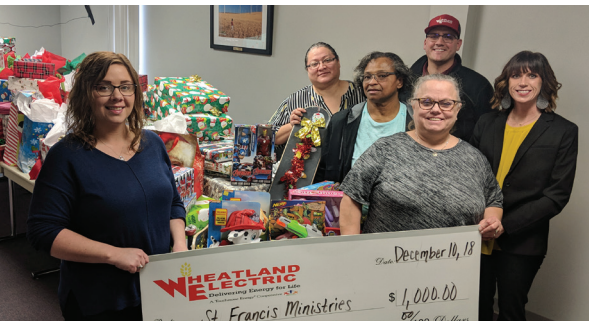
Wheatland employees present a CoBank Sharing Success grant and gifts for 65 local children to support the St. Francis Ministries' Christmas for Kids Campaign.

For the second year in a row, WHEATLAND partnered with St. Francis Ministries for its annual Christmas for Kids campaign. This program ensures that more than 3,200 children in foster care throughout the Midwest receives Christmas gifts. Nearly 40 Wheatland employees signed up to purchase