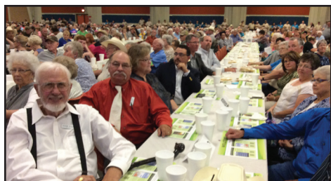
Approximately 1,400 Tri-County Electric Cooperative members and guests enjoyed a barbecue dinner at the annual meeting on Sept. 10.