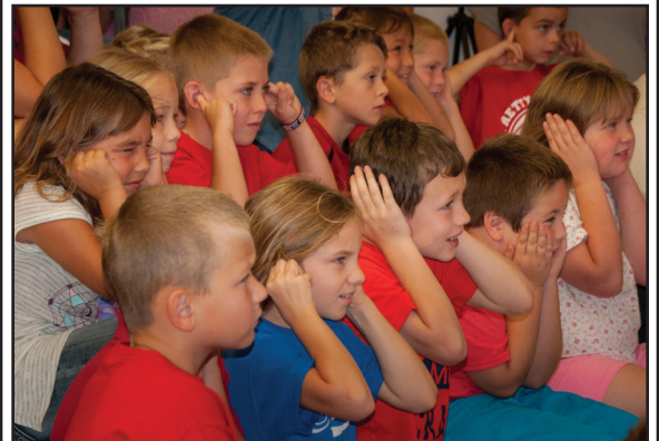
Students react to the electric cooperatives' High Voltage Safety Demo at the Kansas State Fair.

participate in hands-on experiments related to energy generation, and the KansasWorks Mobile Workforce RV that promoted available job openings in the energy sector. The Expo also featured the new mascot Energy Expert Professor Max Powers. Professor Powers appeared on signs throughout the Expo to help navigate students through the many available learning opportunities.