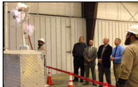
As part of Sen. Roberts' tour of the co-op, Victory linemen gave a high-voltage safety demonstration.

The bill is designed to provide multi-employer pension plans like NRECA's with some certainty regarding future funding regulations. The bill is now awaiting consideration by the U.S. House of Representatives.