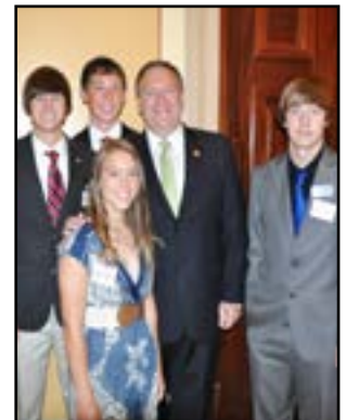
The students hosted a breakfast for the Kansas Congressional delegation. Congresswoman Lynn Jenkins (left photo, center), Congressman Tim Huelskamp (center photo) and Congressman Mike Pompeo (right photo) took the time to visit with the youth tour delegates and to pose for photos. More photos are available at www.youthtour.coop .