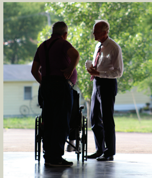
Senator Jerry Moran visits with Jefferson County constituents at FreeState Electric Cooperative on Monday, June 11, 2018. Moran stopped at FreeState as part of his Kansas Listening Tour.

During his time at FreeState, Sen. Moran shared that the VA MISSION Act recently became law, making it easier and more efficient for all veterans, especially in rural Kansas, to receive deserved care. He also discussed the Farm Bill, how our country must responsibly negotiate global trade deals, talks with North Korea, and the importance of rural broadband to small communities.