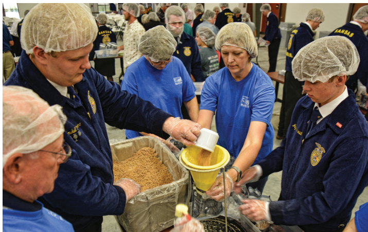
Bluestem Electric volunteers work beside FFA students at the Feed the Funnel charity event, sponsored by Kansas Electric Cooperatives and CoBank's Sharing Success grant program.