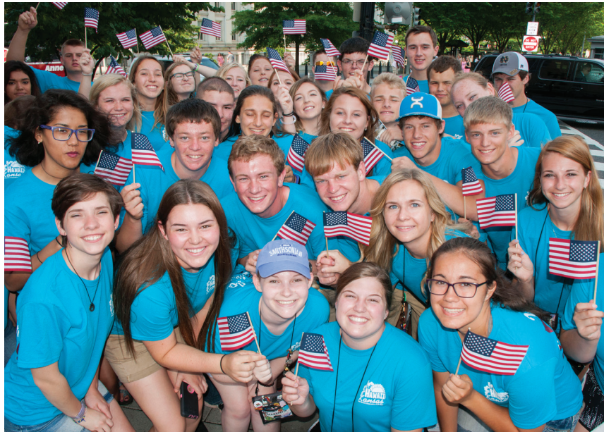
The Youth Tour delegates celebrate Flag Day with a tour of the White House.